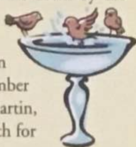
Peter Tate Rooks Hill

Don't be alarmed if you hear the sound of rapid gunfire over the next few weeks - it's probably a Greater Spotted Woodpecker trying to attract a mate. It's that time of year when you'll see more bird life in your garden as the migratory birds start to return. You should be able to spot Swifts flying over and see Sedge Warblers in the vegetation down by the concrete bridge over the Chess. Listen out for the mellow warbling of the Blackcap and the Chiffchaff chirping out its name in the tall trees. Sparrowhawks now outnumber Kestrels in the area so pity the House Martin, back from Africa, and likely to become lunch for one of these birds of prey.