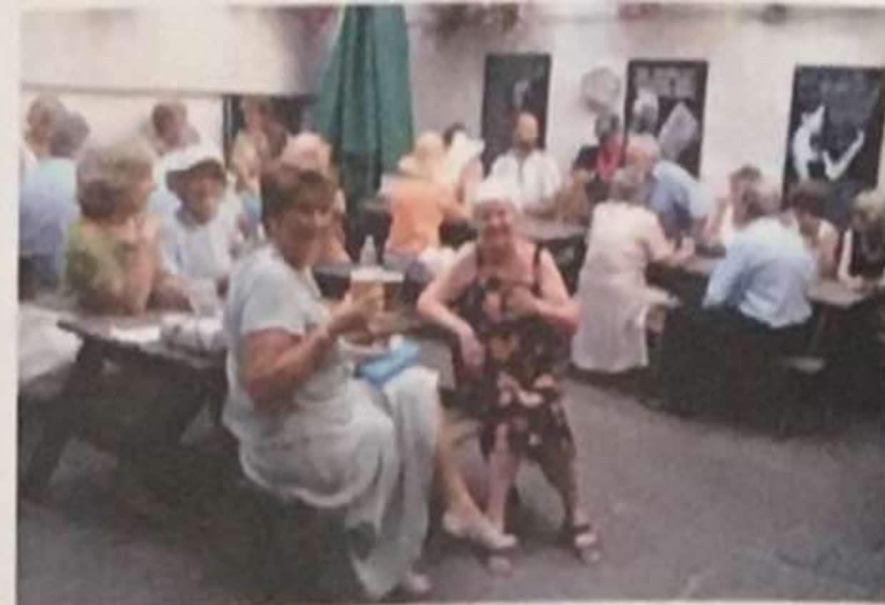
Attempting to cool off at Morse's Turf Pub