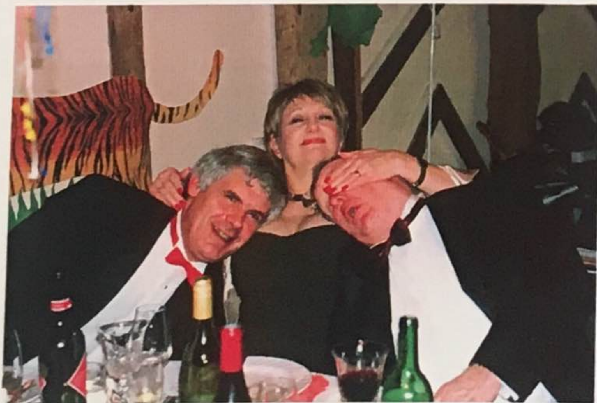
The LRA's departing Chairman and the Wine Club's Treasurer enjoying the privileges and comforts of their exalted rank

The Barn had been fabulously decorated: jungle themed, with night time at one end and sunrise at the other. Animals were on the walls, a canopy on the ceiling, snakes hanging from the rafters, and tables full of balloons, crackers, whistles and goodies too numerous to mention. Sparkling glasses of champagne on white linen received the guests. A four piece jazz band, 'The Elastic Band', played softly whilst people enjoyed canapés, served by smiling girls. Everyone took their seats and feasted on a sumptuous, multi-course dinner. Then, replete, everyone danced (and drank) the night away. I heard someone say "This is the best New Year's Eve ever" and it was. If you really wanted to party in style then this was the place to do it.