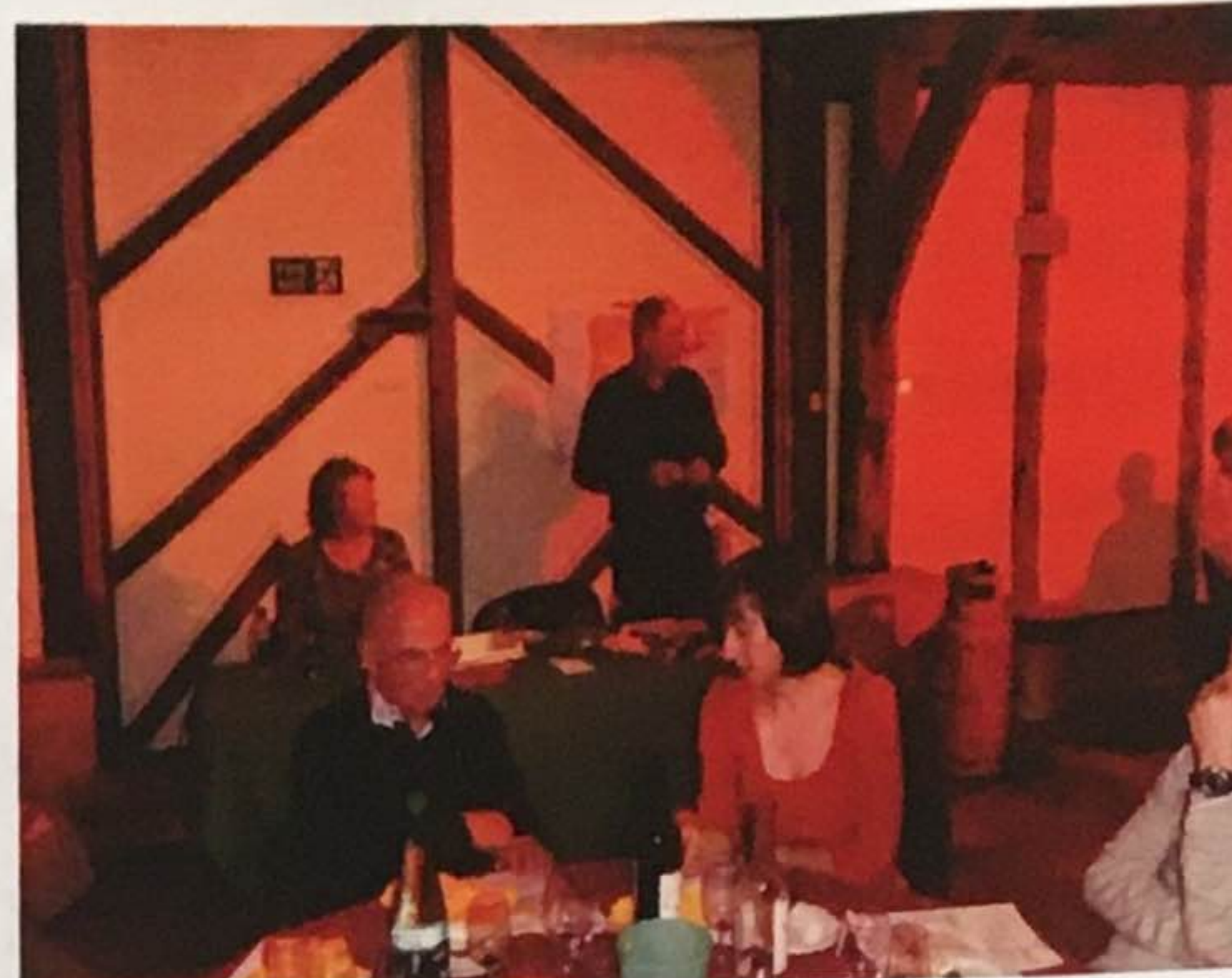
Spanish Wines and Tapas Evening