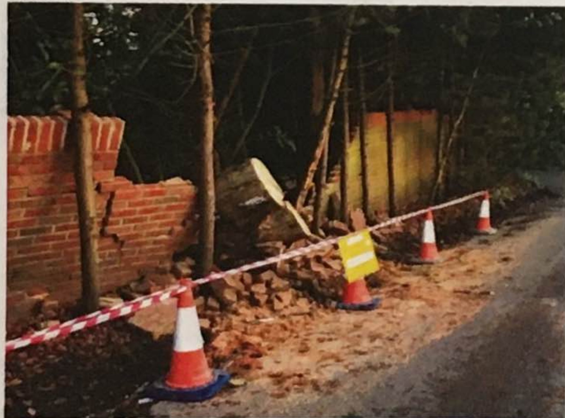
The tree fell across the road demolishing a wall, over-head cables and damaging a telegraph pole.

During the period between Christmas and New Year high winds knocked a large tree down from the gardens of Cariad in Sarratt Lane.