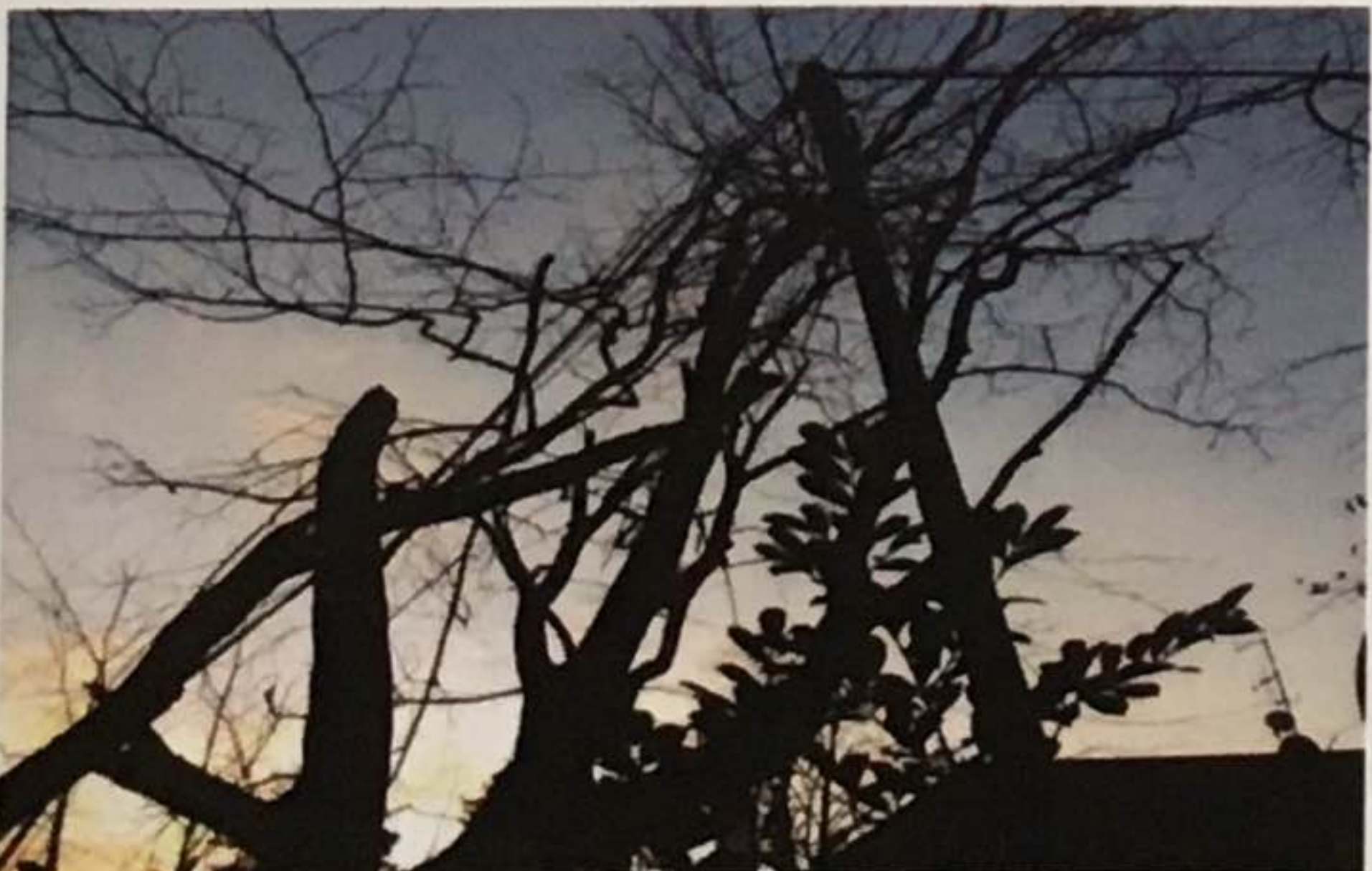
Repair works to the cable and pole were carried out very quickly.