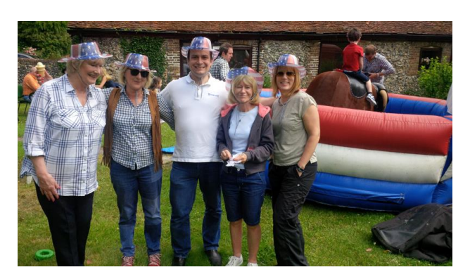
Some of the LRA Committee at the BBQ

The BBQ was very popular and many people went back for seconds. There was also Giant Connect 4 and Cactus Hoopla as extra entertainment.