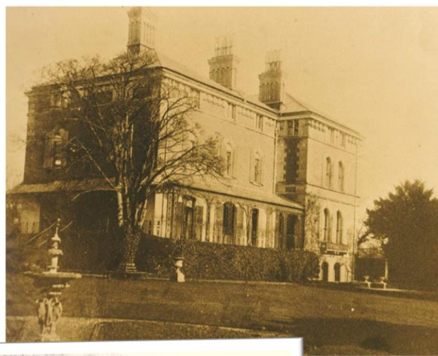
Below: Loudwater Mill and Glen Chess in its heyday.